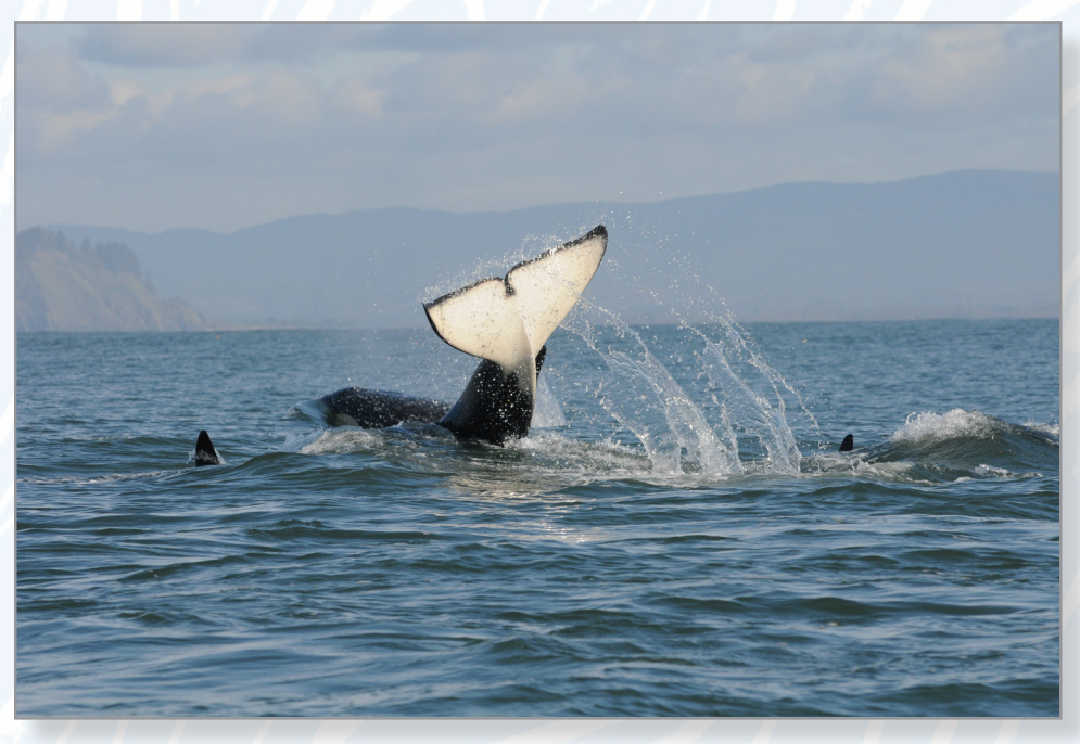
Photographed during Winter 2015 killer whale research survey to better understand different sources of salmon prey.

NOAA Fisheries also consults under Section 7 of the ESA with other federal agencies on issues such as operations of dams, recommending changes to make them safer for fish. These improvements are now well underway throughout the Columbia River Basin, which is home to one of the largest endangered species recovery programs in the country.